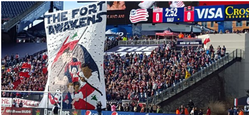
Opening Day, New England Revolution, 2016

We hope you enjoy our newsletter. Feel free to share this with your friends or send us their email to be added to our mailing list. Please contact us with any questions or comments or to be removed from the list.