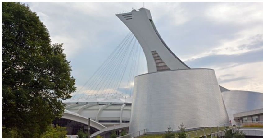
Montreal Olympic Stadium, photo taken during a trip in September

We hope you enjoy our newsletter. Feel free to share this with your friends or send us their email to be added to our mailing list. Please contact us with any questions or comments or to be removed from the list.