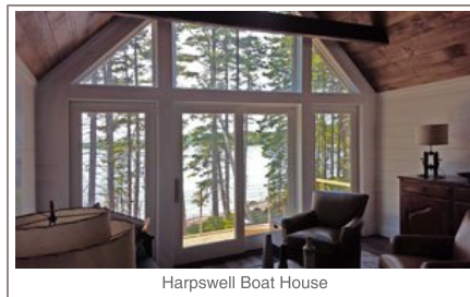
Harpswell Boat House

We have a few projects at various levels of construction. Clockwise, the Harpswell Boat House was just occupied. The Bridge House is currently installing wood ceilings and the Garage / Studio addition will provide aging-in-place in downtown Brunswick.