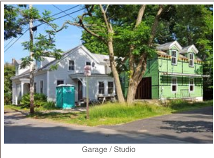
Garage / Studio