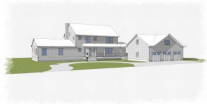
Proposed view from the north

The Re-Modular: A single story modular home in Brunswick has it all, location, location, location, and not much else. DM/A is turning this ho-hum modular into a modern "farmhouse" (without the animals) with open and light-filled space inside for a family of four.